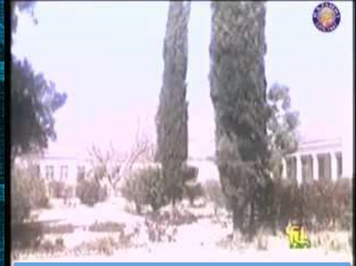
BR Ambedkar : The Chief architect of Indian Constitution