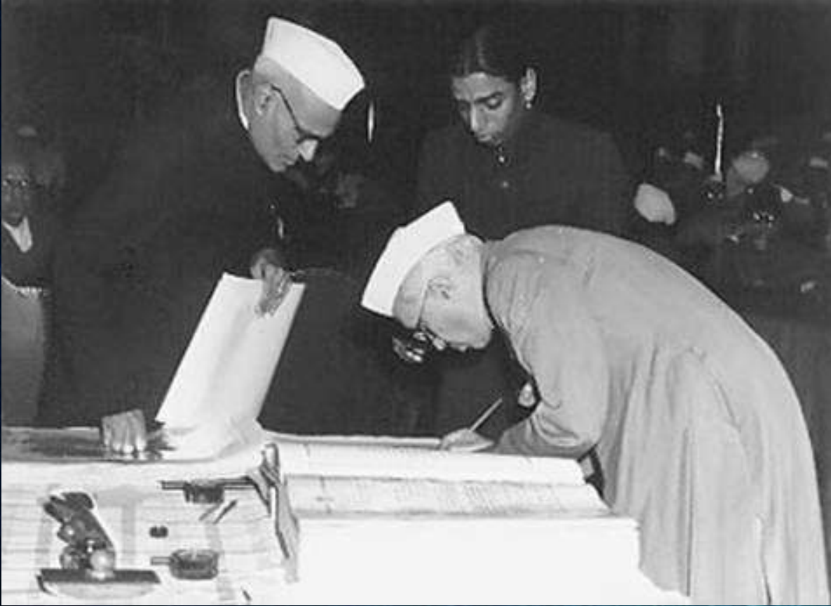
Pt. Nehru signing on the Constitution